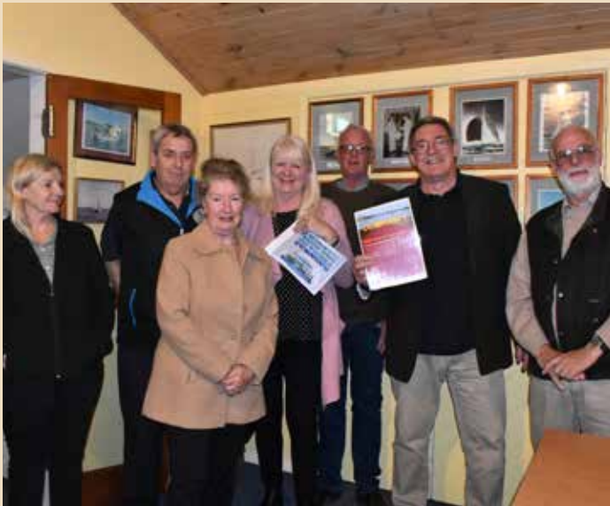
Presentation to representatives of the PS Curlip.