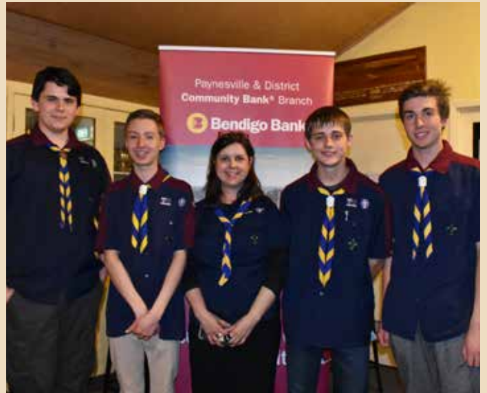
Presentation to the Paynesville Sea Scouts Venturers group.