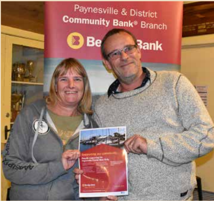
Presentation to the Paynesville Classic Boat Rally group.