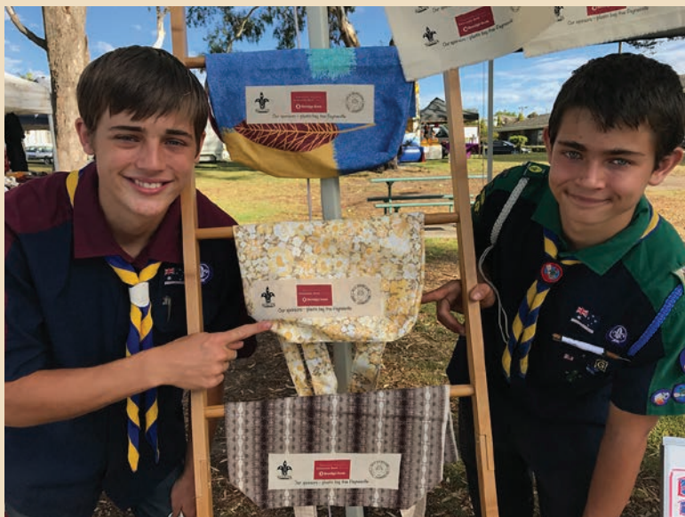
Paynesville Venturer Sea Scouts – Break the Bag Habit project.

Paynesville & District Community Bank ® Branch is proud to support many local clubs and community groups, while promoting our business and financial services, which support growth in local business and the community.