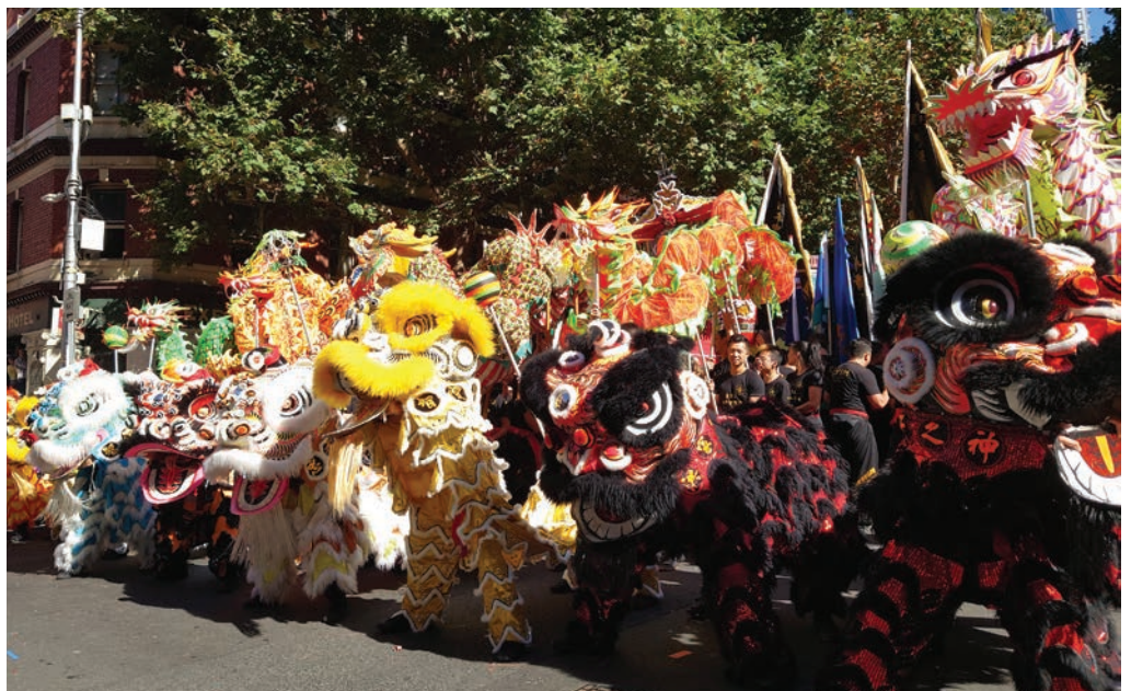
Above: Spectacular line up of Lions at Chinese New Year Festival in Melbourne close to Chinatown Office: