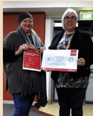
Red Cross Eyre Peninsula partnered with Kirton Point Children's Centre for a grant to assist with transport of children to sessions.