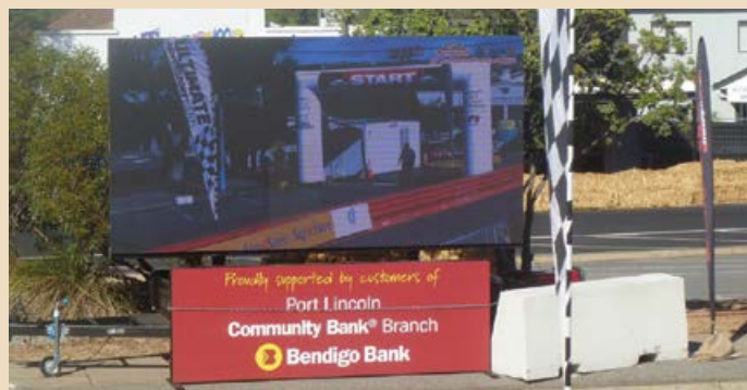
Above: One of the Big Screens around the track – shows all the action!

We have been supporting this event each year and for 2020 we will be providing $25,000 for the six Big Screens for around the track at the event; what makes it even better is that we have the Port Lincoln High School Media Students and staff assisting with the operations for the screens. These screens make the track action viewable from many more angles. This event will have extensive online exposure, we look forward to the 'Bendigo Bank Replay' and a weekend of great car action live here in Port Lincoln.