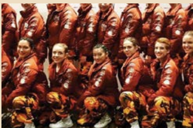
Funding given to MTC Dance enabled them to attend a competition in Adelaide.