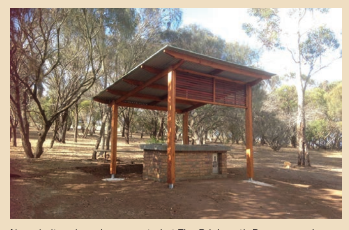
New shelters have been erected at The Brinkworth Reserve made possible with a grant in 2018 – head on up for a BBQ soon with your family.