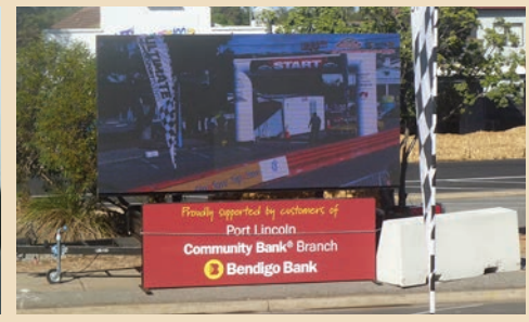
Left: Mount Dutton Bay Progress Association defibrillator. Middle: Eyre Peninsula Community Foundation new laptop. Right: Teakle Autosprint big screens.