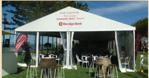
Tunarama Inc. grant for marquee.