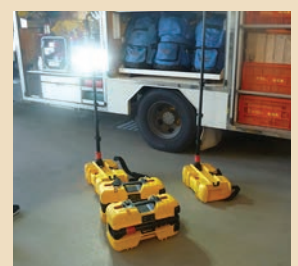
Local SES Group grant for portable lighting units.

The Grant Program will be open for applications (online only) from 6 August to 4 September with successful grants awarded to groups at our AGM in November.