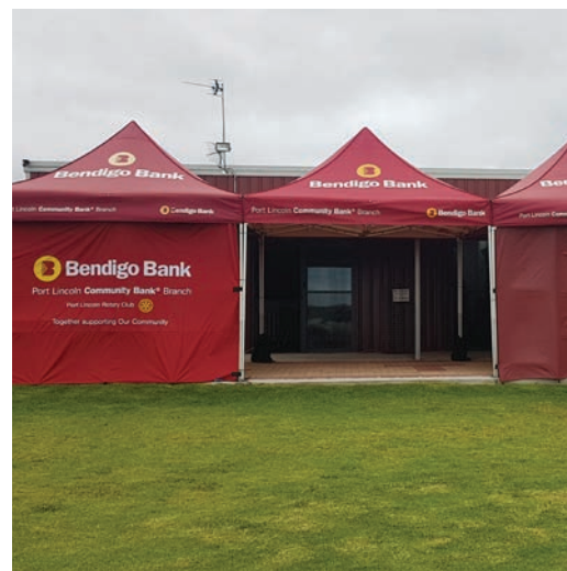
Sponsorship of our marquees at Tasman Cricket Club.