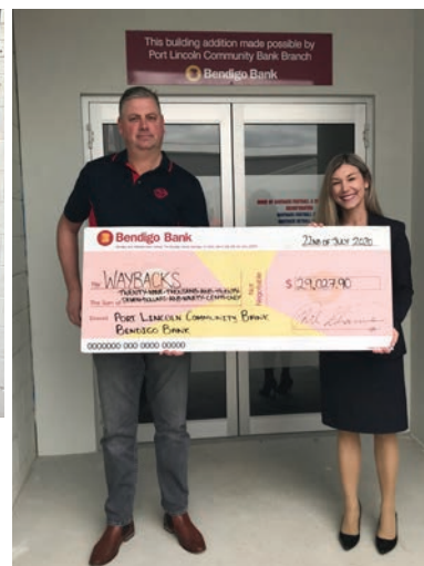
Work in progress and the 'Big Cheque' presentation.