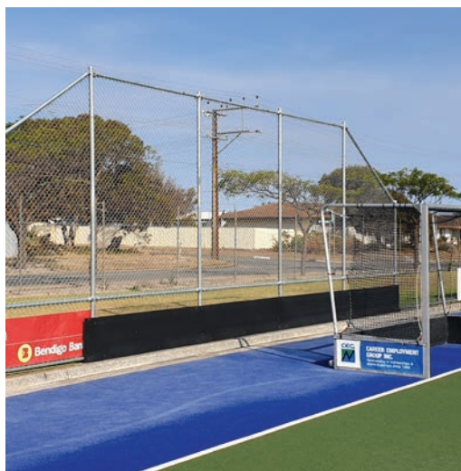
Port Lincoln Hockey Association's new safety fencing thanks to a grant for $23,000.