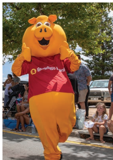
Piggy at Tunarama 2020 – always a crowd pleaser!