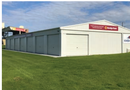
New facility at the Port Lincoln Racing Club.

In 2019 we granted $20,000 towards the building of a permanent facility. The Port Lincoln Racing Club is the largest racing club on Eyre Peninsula and conducts 14 race meetings annually, along with the Kimba Racing Club conducting its annual cup meeting. Port Lincoln is one of six provincial racing clubs in South Australia and conducts an annual cup meeting, attracting many thousands of people from the community, region, and state to the event. The ability to use this facility for major race meetings and for various events has showcased the bank's ongoing commitment to our community.