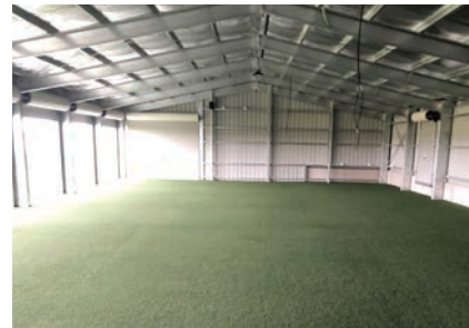
New facility Interior.