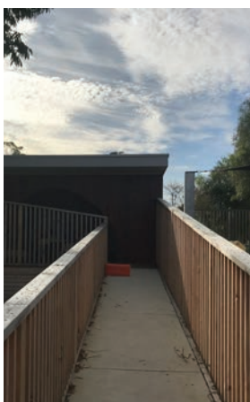
Grant funding has made this centre an engaging safe place for our children to learn.