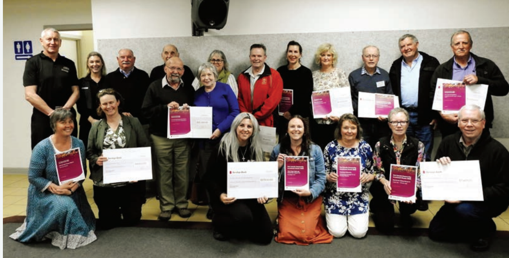
2020 Grants recipients.