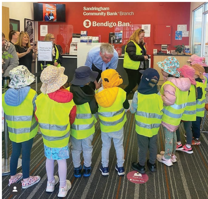
Nagle PreSchool visit to Community Bank Sandringham.