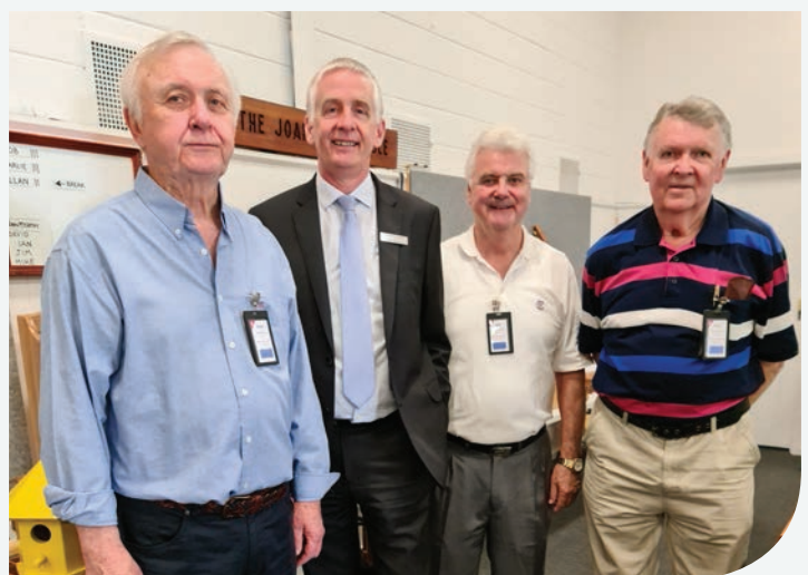
Top: Black Rock House. Left: Black Rock Jets. Above: Men's Shed.