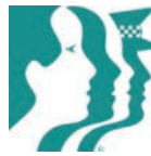
Neighbourhood Watch 3191