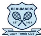
Beaumaris Lawn Tennis Club