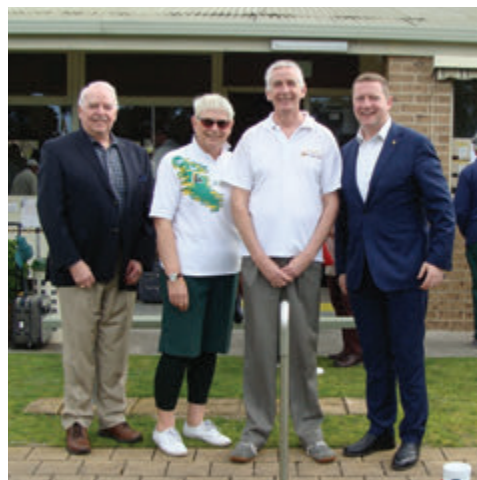
The Opening of the Green at Sandringham Bowls Club

We are supporting inspirational intergenerational programs involving two pre-schools and aged care facilities - Nagle Pre-School kids are visiting the elderly at Regis Aged Care and Black Rock Pre-School kids are visiting Fairways Aged Care residents. We are also funding the development of the kitchen garden at Sandringham Primary School.