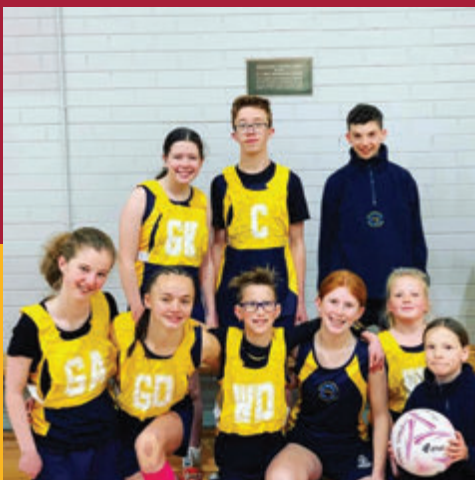
SDNA All Abilities Netball