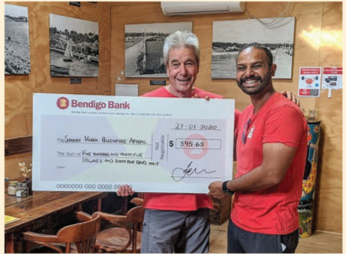
Sandy Kiosk presents their cheque for the bushfire appeal