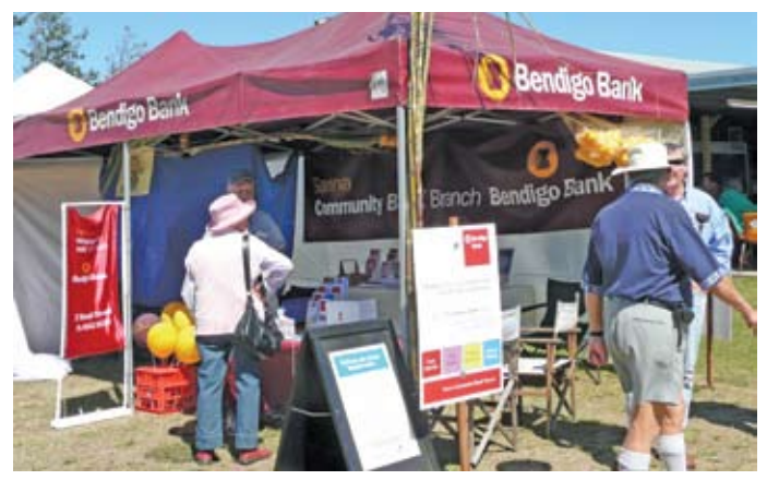
▲ Manning the Stall at Sarina Show

We supported the Sarina Show again this year with a $200 bank account for the lucky gate ticket. We also operated a site helping promote and enhance our profile in the community.