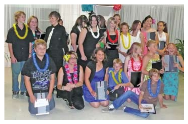
Sarina State School Year Seven Graduation

Sarina Local Ambulance was the recipient of $1,520 made available by the branch to purchase the latest Navmans for their units. The Directors saw this as a very worthwhile project as it will enable the paramedics to have quicker response times.