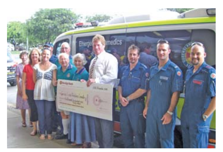
Presentation of cheque to Sarina Ambulance for Navmans

Staff and Directors also entered teams in support of the Ambulance Bowls Day.