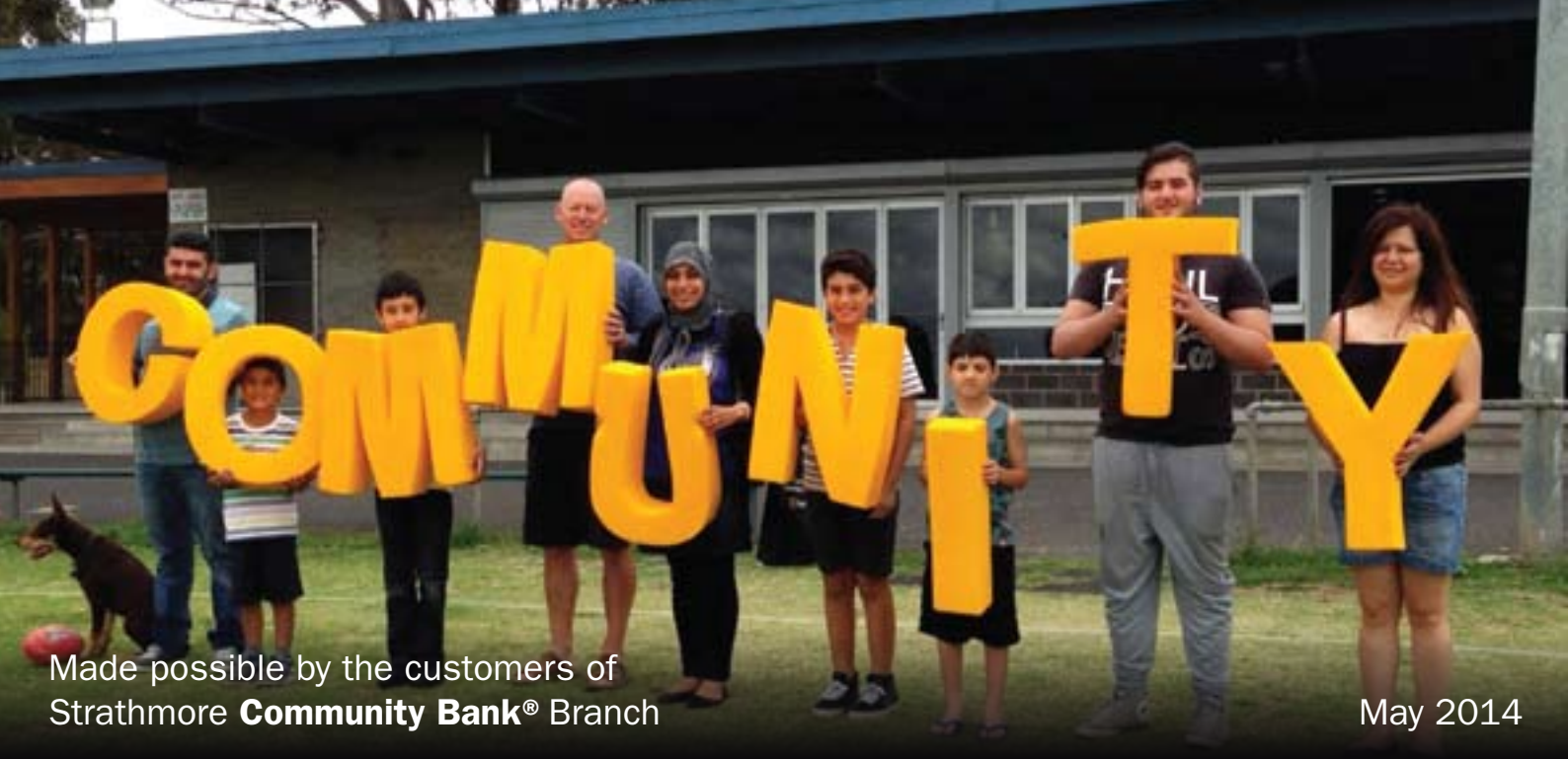
Made possible by the customers of Strathmore Community Bank® Branch