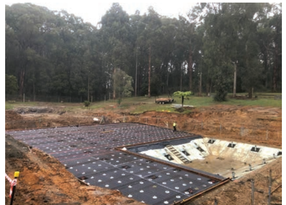
Left: Screw pile install. Above: Blinding.