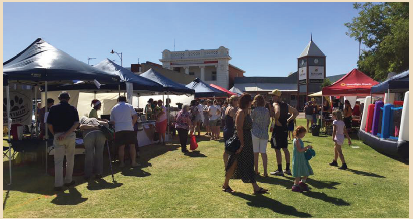
Workshops are being held each fortnight at the Northam Farmers Markets.