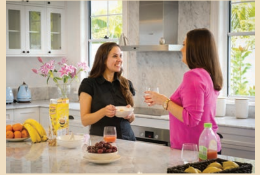
Friends share some great credit card advice.

Here's a few handy reminders when it comes to managing your credit card debt. With the cost of living continuing to go up, it's more important than ever you are on top of your credit card debt.