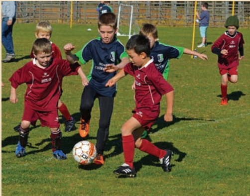
Toodyay Soccer Club promotes inclusiveness and fun.

Registrations will open for the 2019 season in March.