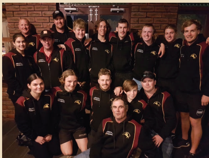
The Lions new jerseys were a big hit with both players and spectators.

As a long-time sponsor of the Lions, the Toodyay & Districts Community Bank ® Branch contributes funds each year of the deal