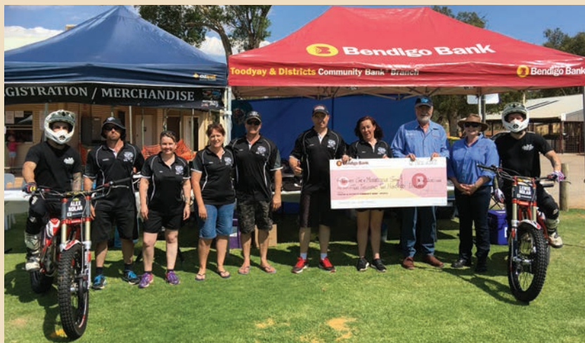
Weekend festivals pull a crowd.

“We support a great number of local community groups, organisations and festival events. We recognize Toodyay’s growing