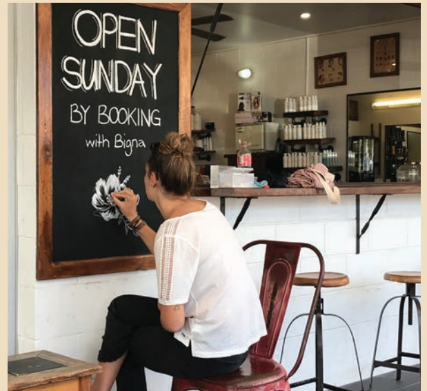
Northam Women in Business supports the dreams of women in business.