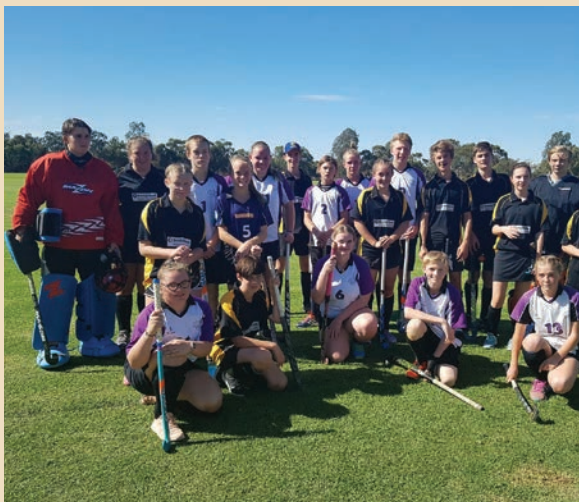
Northam Hockey Club receives much-needed funding from the Community Bank ® branch.

The Toodyay & Districts Community Bank ® Branch is a true community venture, offering a full range of banking products and services in a business model designed to strengthen the local community.