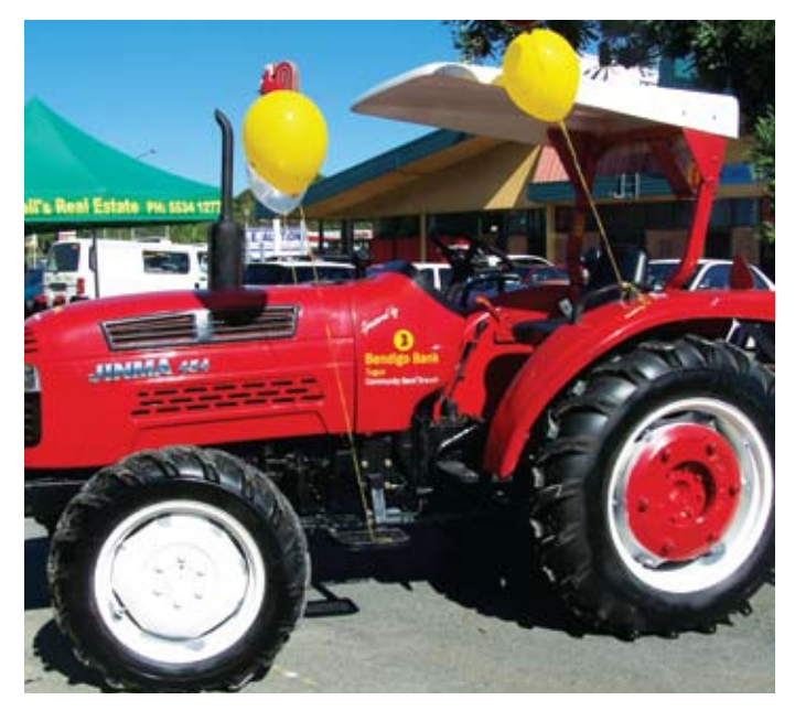
Tugun Surflifesaving tractor.

The Tugun Surf Lifesaving Club tractor, sponsored by Tugun Community Bank <sup>®</sup> Branch in 2006, continues to be of great value and importance to Tugun Surf Club and Tugun beach. The tractor is utilised each weekend during summer to tow the patrol arena down to the beach. It is also used to tow surf boats for training and inflatable rescue boats for patrol.