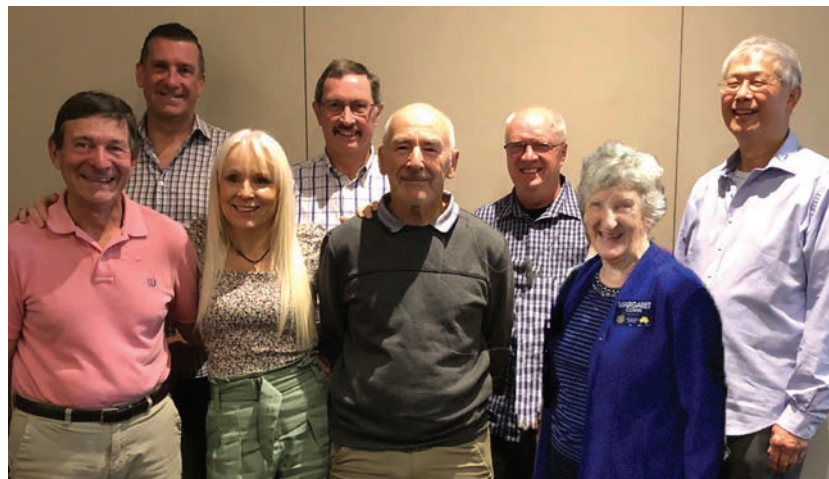
Simple Steps Program Committee.

Simple Steps is a Pilot Program of the Rotary Club of Knox created for the sole purpose of providing funding for mental health counselling in the Knox area. The program assists young people in the Knox area facing mental health issues and suffering financial hardship.