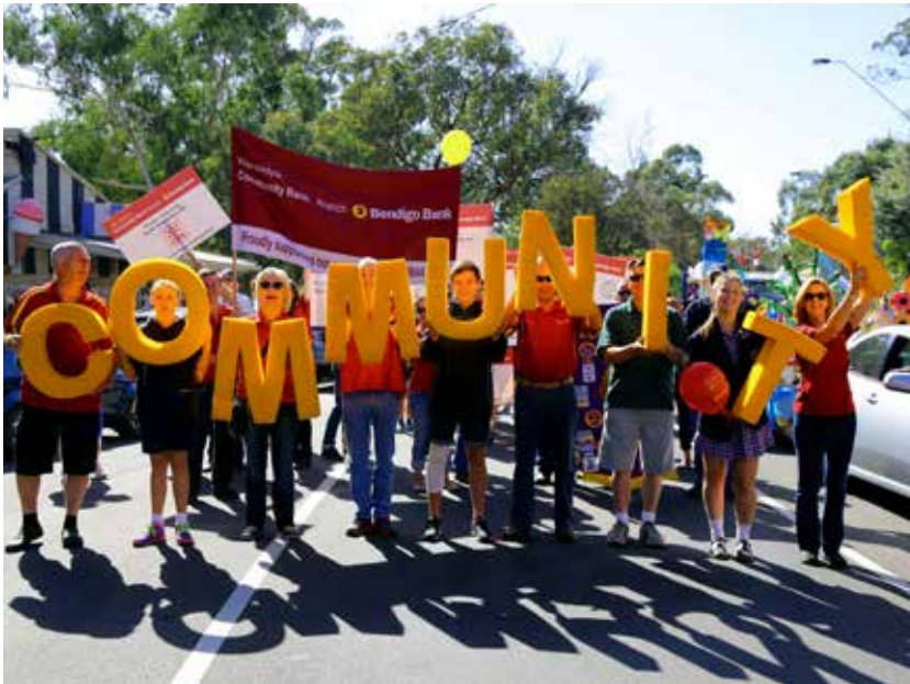
We missed the festival this year but have fond memories of attending many. Here's an image from our archives.