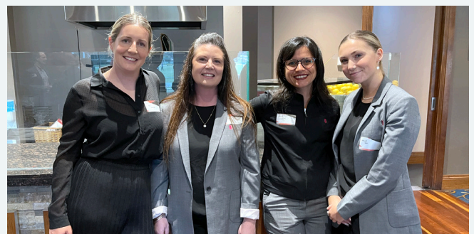
Above: Board directors, staff and community group guests at the presentation evening in November.