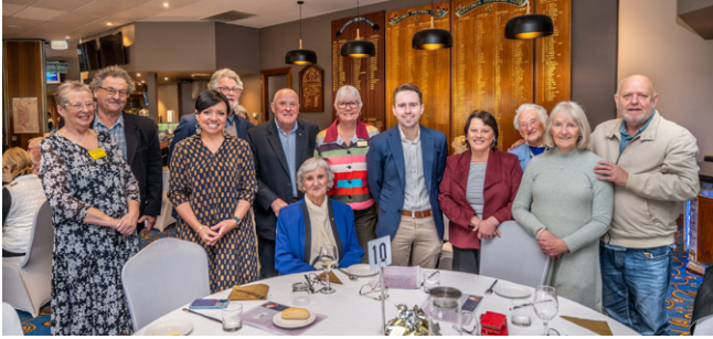
We are proud to support to Hastings–Western Port Historical Society.