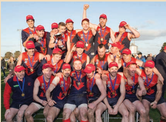
Above: Winners are Grinners – Lismore/Derrinallum Senior players receiving their medals and Bendigo Bank Caps.