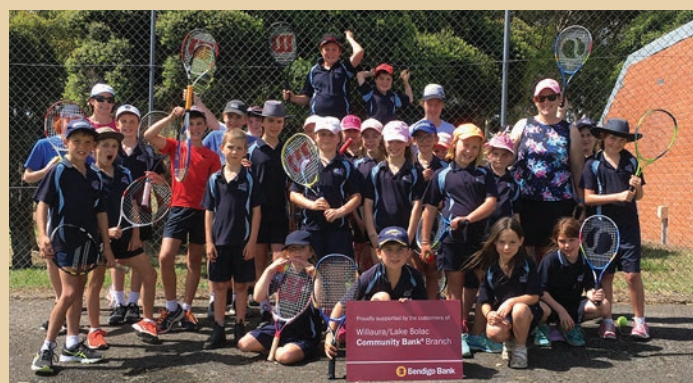
Above: Game, Set, Match! Lake Bolac Junior Tennis Players ready to hit the courts to learn some more tennis skills.