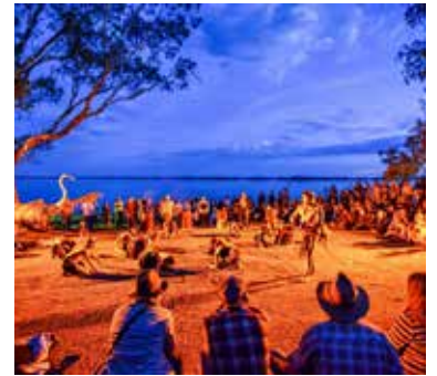
▲ 2018 Eel Festival Twilight Celebrations.