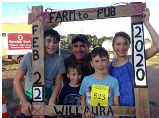
▲ The Price family enjoying a day out at the Farm to Pub.