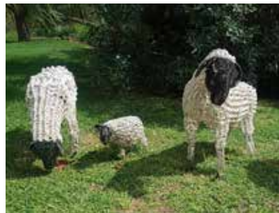
▲ Ewe are kidding me... Are these real or not... we don't care they are so cute anyway.

On the farm.... We are a district heavily invested in agriculture, and the good news is that Summer and Autumn have been relatively kind. Most in our district were able to harvest quite good crops, cut plenty of hay, fatten lambs and see their sheep do well. An early break has been welcome, and there is plenty of action in the paddocks. Here's hoping for continuing good weather and a profitable year for all.