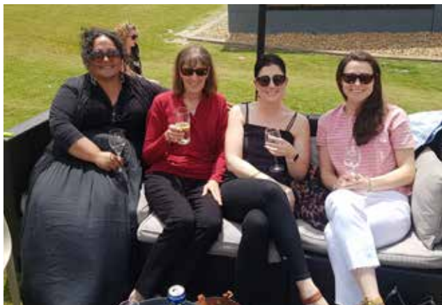
▲ A sunny day in December at Pomonal Estate was the venue for our staff Christmas breakup. We enjoyed a lovely relaxing afternoon listening to live music and tasting the delicious food that was on offer. Here's cheers to Christmas and a successful 2019 that was.