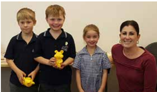
One of the creative and colourful entries submitted into our colouring competition. Colouring Competition Winners from Willaura and Lake Bolac Primary Schools and Willaura and Lake Bolac Kindergarten. Congratulations and well done to all the participants.