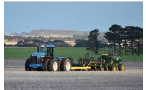
▲ A local farmer already into his cropping program sowing after the recent rain.