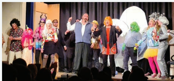
Cast of Above and Beyond.