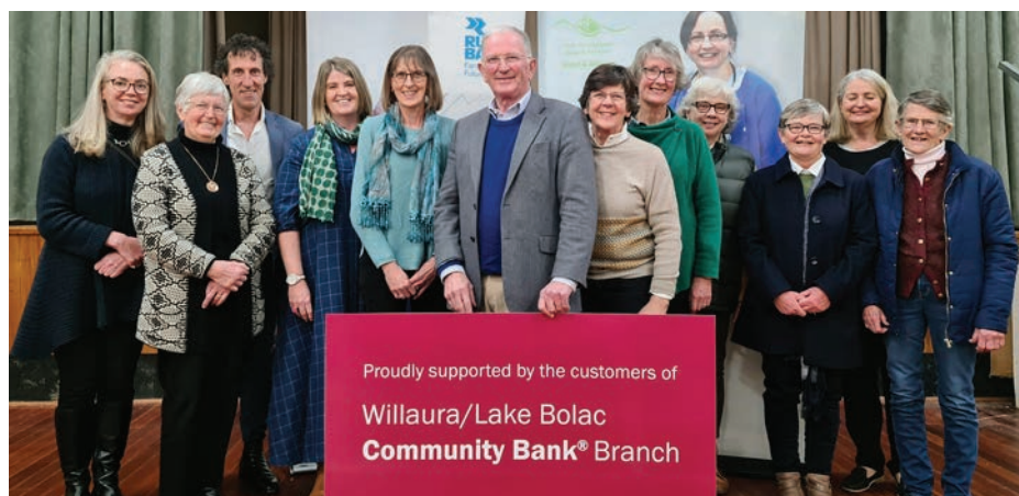
Proudly supported by the customers of Willaura/Lake Bolac Community Bank® Branch

Together we make great things happen in your community.