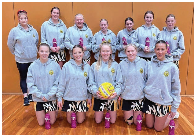
The 13 and under squad, 15 and under squad, and 17 and under squad.