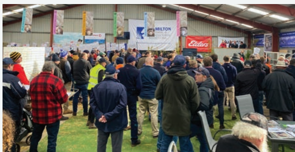
A sea of people watching the ram sales in action.