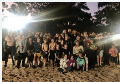
Enjoying the twilight celebrations were many locals and visitors.