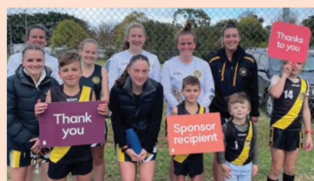
Woorndoo/Mortlake Football Netball Club players.