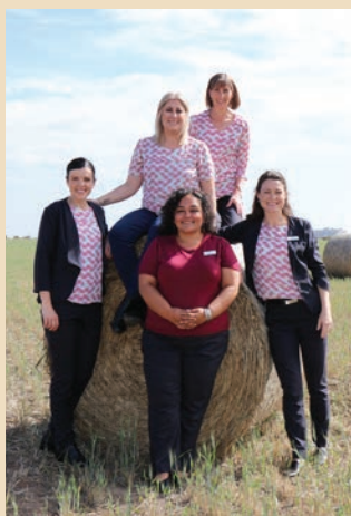
Getting into the Agriculture spirit the girls were out and about having some fun at a local farm recently.

We rarely stop to consider how agriculture makes the world a better place and we should be proud of our farmers and the supply chain that gets the products from paddock to plate. So on 21 November we celebrated National Agriculture Day at the Lake Bolac Community Bank ® Branch inviting people to call in for a cuppa and cake. The cup cakes disappeared quickly with many locals dropping in to help celebrate this special day.