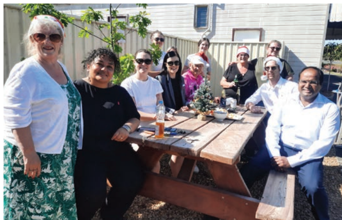
The team enjoying a catch up at the Christmas gathering.