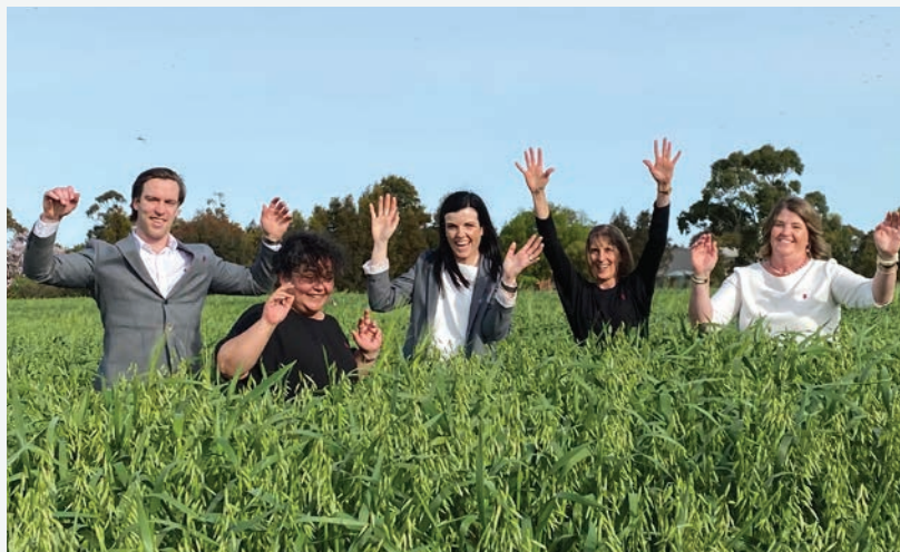
Goodbye Winter, Hello Spring! "Spring" is in the air and so is the team when we checked out a nearby oat crop.