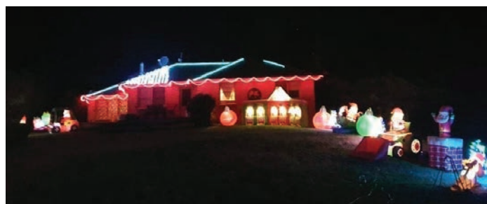
Faith Keirl, Mark Howie and family from Woorndoo created this magnificent display for all to enjoy, and they were also responsible for creating the magnificent light show at the Willaura & District Kindergarten.