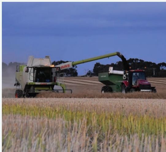
Local farmer busy harvesting their canola recently.

As we write this newsletter harvest is in full swing with grain pouring into receival centres and bunkers across our region. Reports coming in so far suggest that yields and quality are very good, and while not quite reaching last season's spectacular results, most farmers are happy with the harvest.