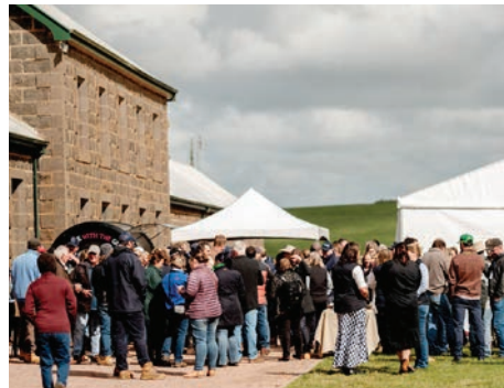
Attendees networking during the lunch break.