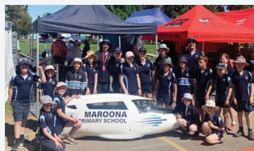
Maroona Primary Schools students and teachers showcasing "Bluenarmi". It looks very aerodynamic and a well-built, creative design.

Your Community Bank continues to support many fantastic community groups, events, and projects and since our last newsletter we were pleased to support the Maroona Primary School's Energy Breakthrough Project. We were thrilled to sponsor the team for $250 which assisted them to cover merchandise costs, cart maintenance, camping appliances and food.