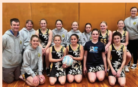
The 13 and under squad, 15 and under squad, and 17 and under squad.