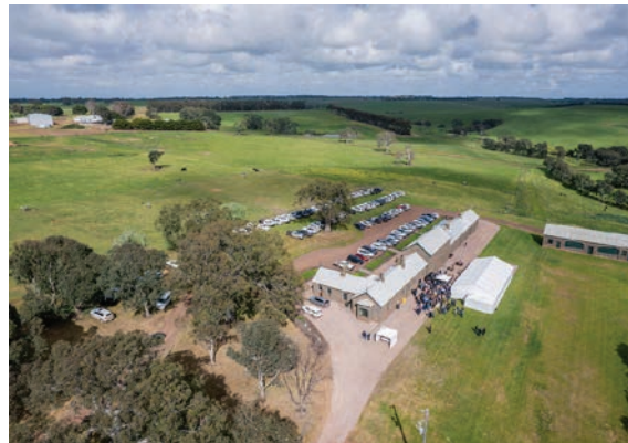
Aerial photo of Chatsworth House 2023 Field Day – what a view!