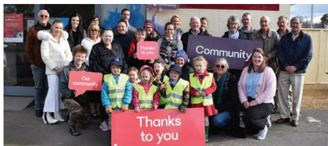
Grant Recipients with Board Members and Staff.