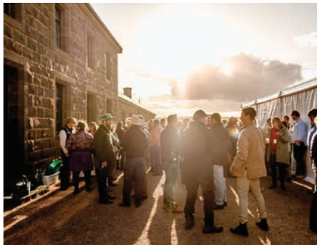
Attendees networking before dinner.