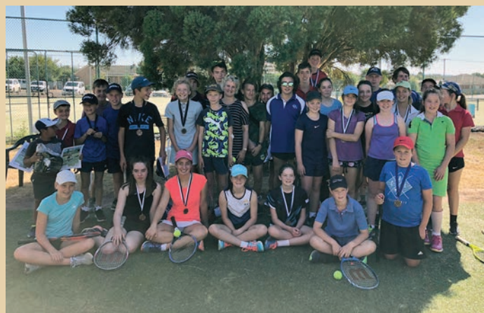
Game, set, match! Proud winners of the Mininera & District junior tennis grand final.

It was the perfect end to the 17/18 season with the grand final played under sunny skies. A good crowd of parents, grandparents and friends were on hand to cheer on the players and they were rewarded with some terrific tennis and some really close matches. Needless to say not everyone can win but there were lovely displays of sportsmanship throughout the morning. Willaura/Lake Bolac Community Bank® Branch were delighted to once again provide $300 in sponsorship funds for the trophies and medallions and congratulate all players who participated on the day. Following the presentations there was a BBQ lunch which was enjoyed by all.