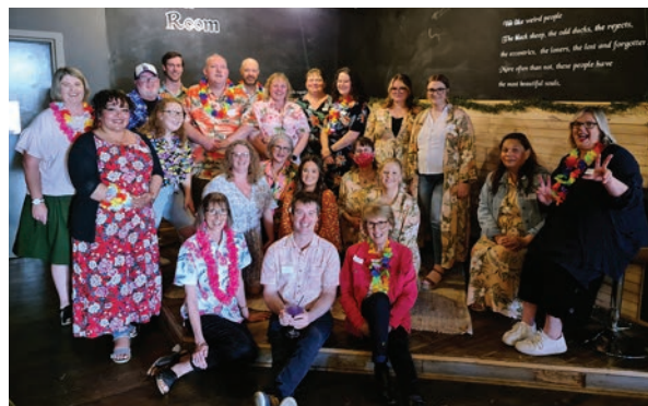
South West Region staff getting into the spirit of the Hawaiian themed night.