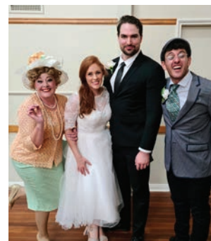
The cast of Confetti and Chaos.