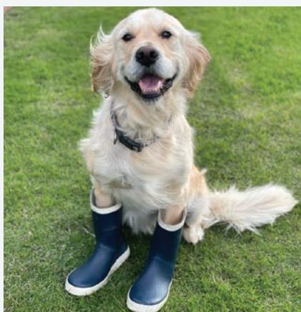
Above: Brrrrr... Hello Winter!!! How cute is Goldie Looking very dapper in her gumboots.... no wet paws for me she's thinking! Top: What a lovely rural, rustic backup for our team photo!

Despite the weather becoming cold and wet and the bitter drop in temperature, there's still a lot to love about winter. Who doesn't like snuggling up in a cosy chair, reading a book, appreciating a hot chocolate, or enjoying the footy. So, until you can trade in a scarf for a swimsuit, try to embrace the cold and make the most of the season! Stay warm everyone!