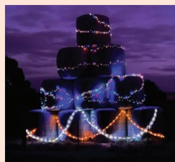
The Howard family got into the spirit of Christmas and used bales of hay to create a stunning pyramid all lit up like a Christmas Tree. It looks amazing!