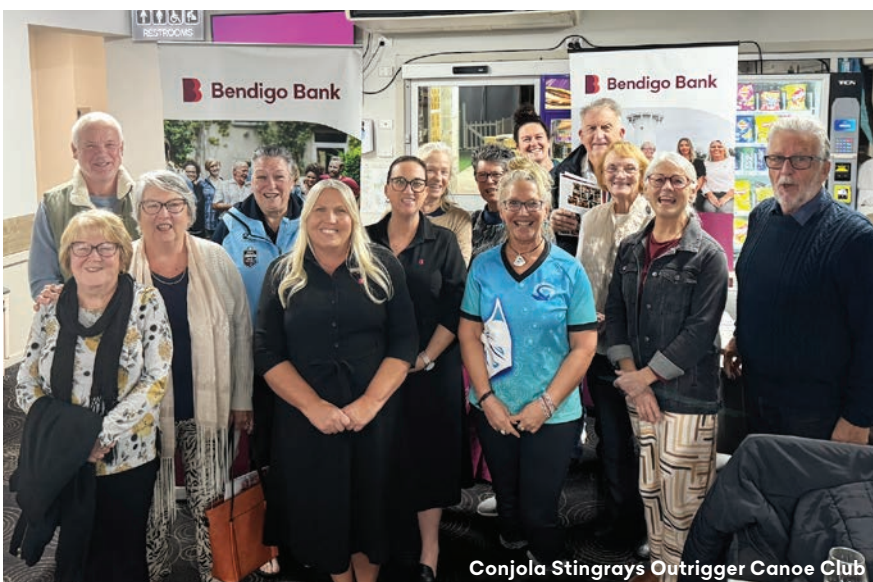
Conjola Stingrays Outrigger Canoe Club