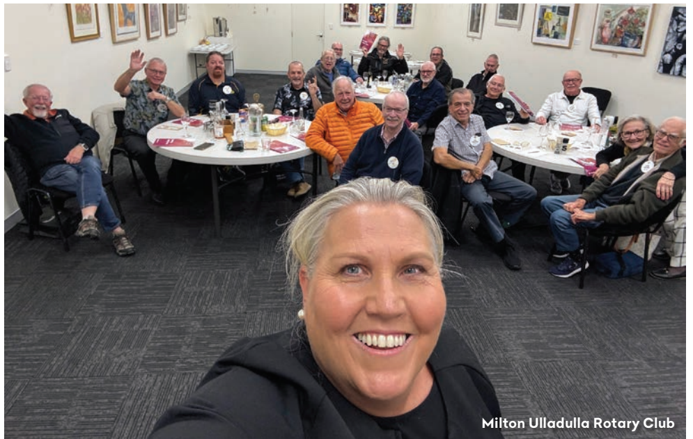
Milton Ulladulla Rotary Club