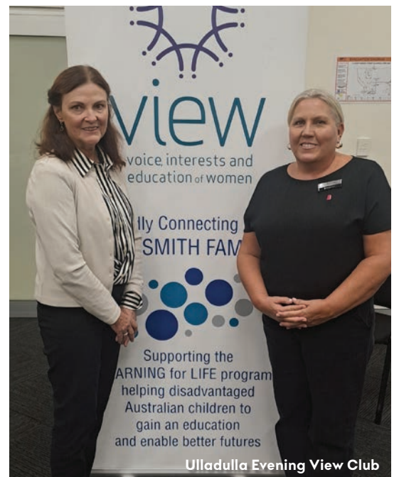
Ulladulla Evening View Club