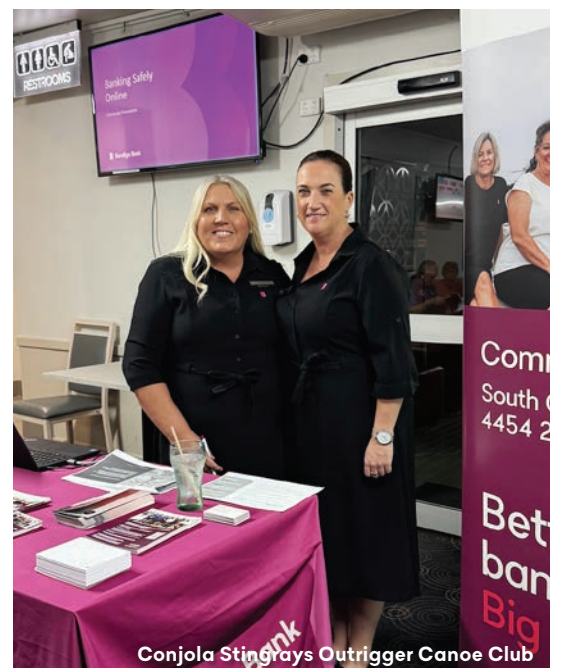
Conjola Stingrays Outrigger Canoe Club