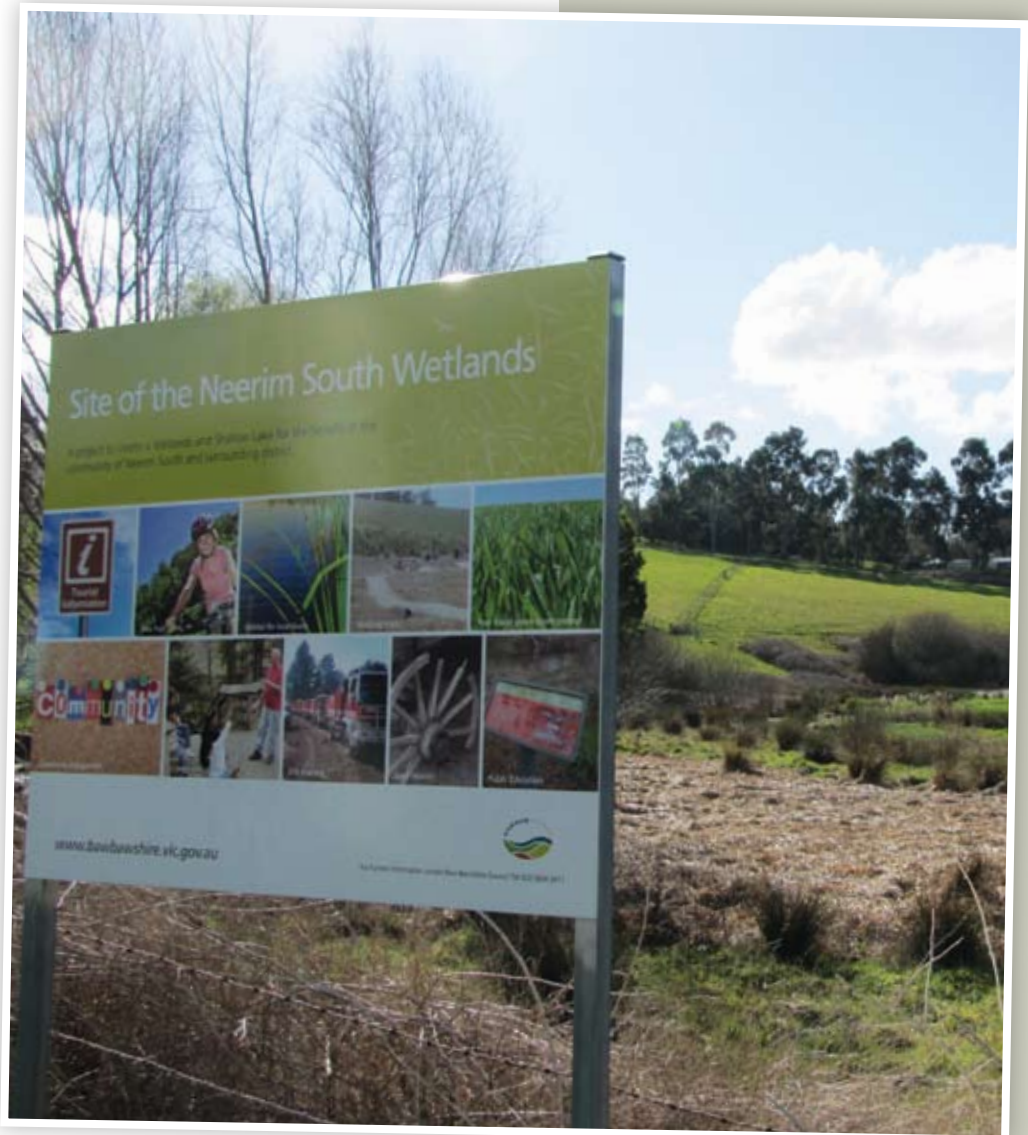
Site of the Neerim South Wetlands.